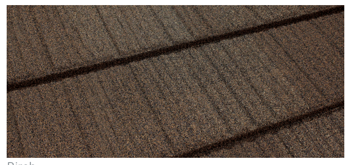
Colors in this brochure are as close to the original as modern printing process will allow.